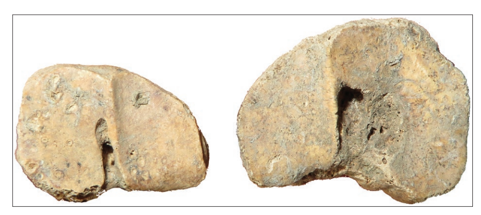
Figure 3: Roe deer metacarpus, on the left, compared with sheep/goat metacarpus (Locus J1, C5), both at the same scale.

The Phasianidae family is also represented here with three first phalanges which were not possible to identify to species level.