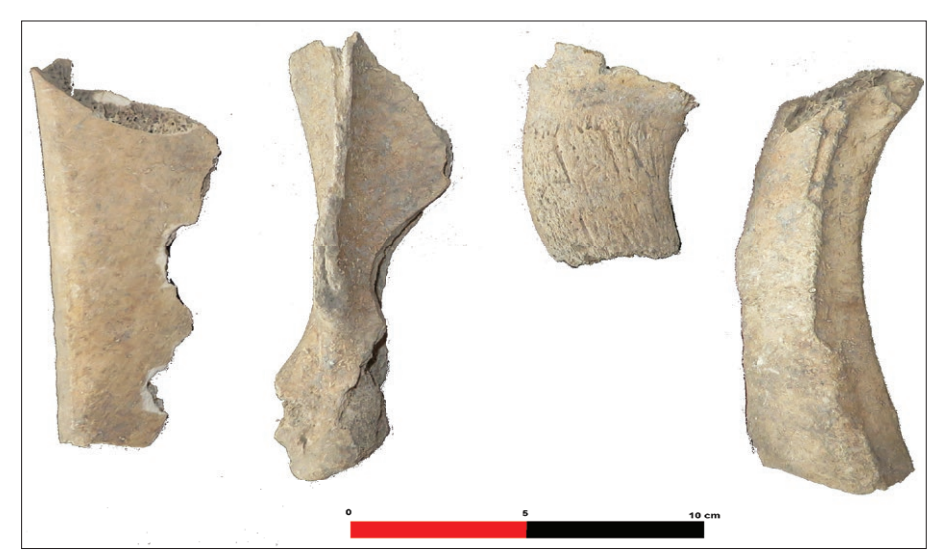
Figure 4: Castro de Chibanes (Locus J1, C5): Two Bos taurus scapulae and one horn fragment on the left, compared with a considerable big rib on the right, consistent with Bos primigenius .